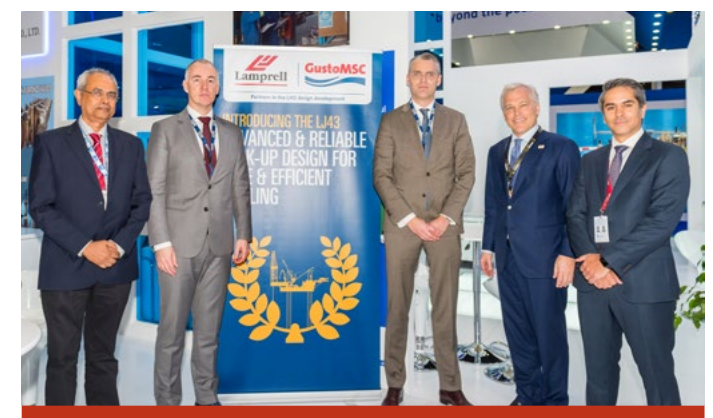
Lamprell's LJ43 jackup rig design, which was co-developed with our technology partner GustoMSC, was showcased at ADIPEC

conference sessions. Management from across Lamprell's business units attended the event, meeting with both current and prospective clients.