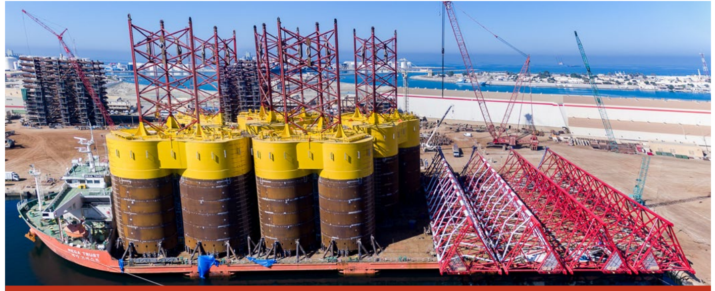
Legs and caissons fabricated in Lamprell's Hamriyah facility for the Master Marine project were successfully loaded out and are en route to CCB's shipyard in Norway

of work for the Haven upgrade will commence in January and involves removing the old upper legs, and then installing the new once the "Mega Trust" arrives at the CCB shipyard. Once that is complete the team will focus on installing the caissons.