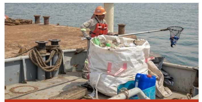
Lamprell regularly holds clean ups in the waterways surrounding its operational facilities

Part of Lamprell's commitment to being an environmentally friendly and sustainable organisation involves periodic cleaning of garbage from the waterways around its operational facilities. Although the garbage doesn't originate from Lamprell's activities, due to tidal movements it washes in and around the areas where our clients' rigs are located or alongside our quayside. If this garbage isn't removed from marine waters by environmentally conscious companies like Lamprell, it poses a serious and potentially deadly threat to marine and bird life. Lamprell is proud of the various initiatives it undertakes to clean up environmental pollution.