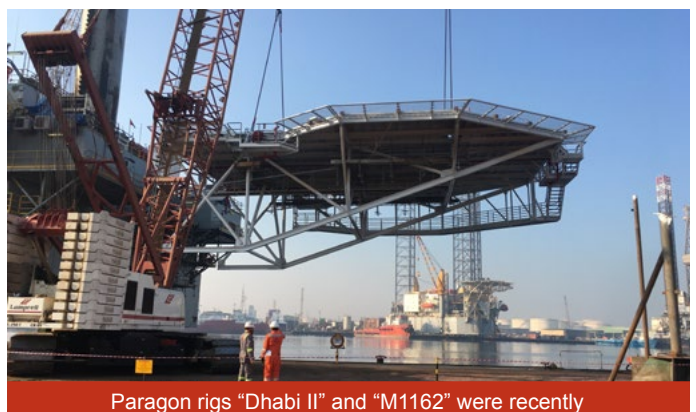
Paragon rigs "Dhabi II" and "M1162" were recently refurbished by Lamprell

Lamprell's relationship with Paragon continued following the receipt of two contract awards in Q4 2017. The first was for a helideck upgrade for Paragon rig "Dhabi II" and the second was for leg removal work for rig "M1162".