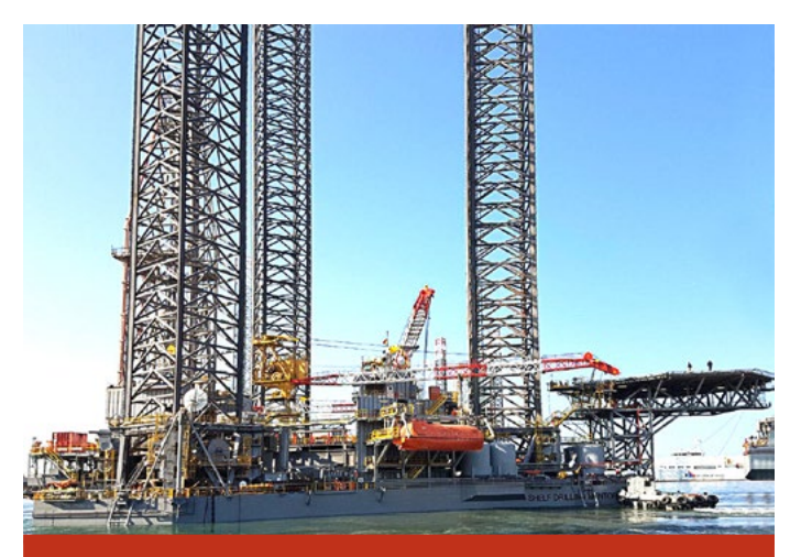
Shelf Drilling rigs "Shelf Drilling Resourceful", "Shelf Drilling Tenacious and "Shelf Drilling Mentor" were recently refurbished safely and on schedule in Lamprell's Hamriyah facility

facility as the shipyard to support them. Work scopes were identified, and the units were upgraded to meet their contractual requirements. As with every contract, health and safety were paramount, and there were no recordable incidents. Despite the challenging schedule, Lamprell completed the upgrades in late 2017, and we look forward to working with this important client on future projects.