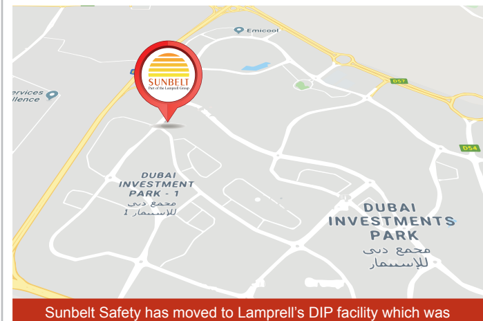
previously occupied by its LRS team

teams, the DIP facility has undergone an upgrade to install an instrumentation workshop enabling the Sunbelt team to improve operational workflows and efficiencies. The relocation is complete, and Sunbelt Safety personnel are now operating from the DIP facility.