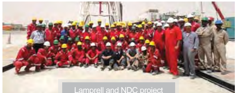
Lamprell and NDC project teams after commissioning