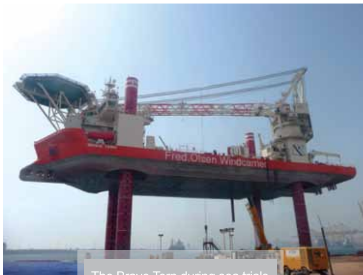
The Brave Tern during sea trials

Following the successful completion of sea trials which included a very extensive Failure Modes Effect Analysis (FMEA) programme involving hundreds of tests over 6 days, 24 hours a day, the 'Brave Tern' sailed away in the first week of October on her maiden voyage to Europe.