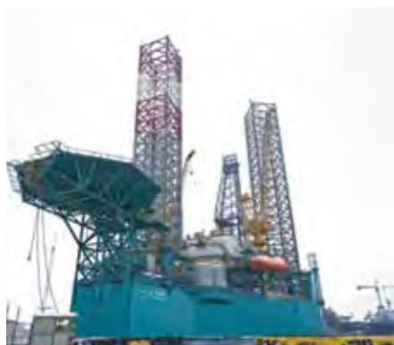
New Build Jackup Drilling Rigs | p.4