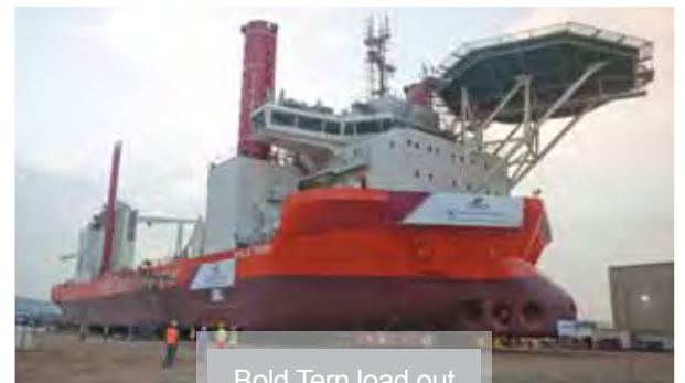
Bold Tern load out