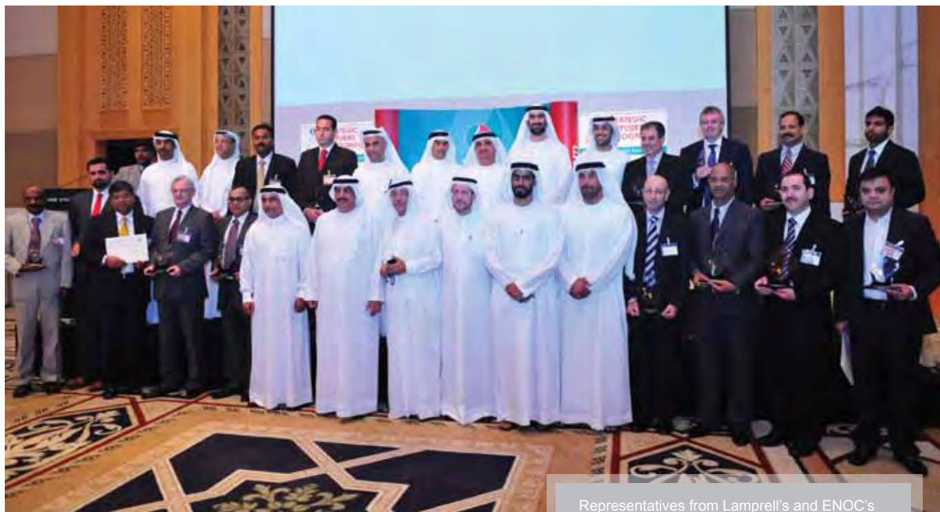
Representatives from Lamprell's and ENOC's management teams with other award winners