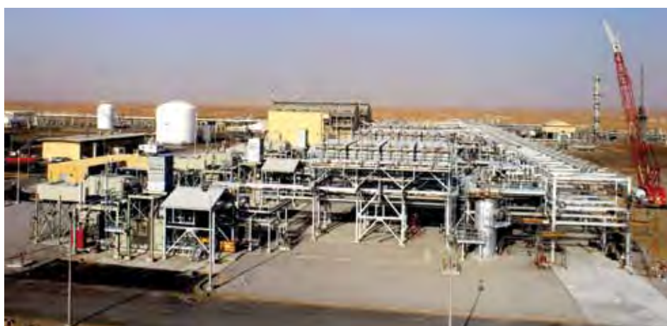
Engineering & Construction | p.13