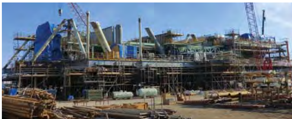
New Build Offshore | p.8