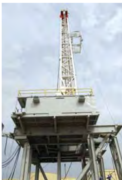
Land Rig Services | p.11