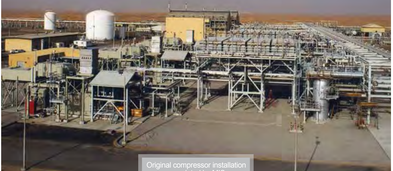
Original compressor installation completed by MIS

The project, a fast track endeavor, encompasses construction engineering, procurement, installation, precommissioning and commissioning assistance.