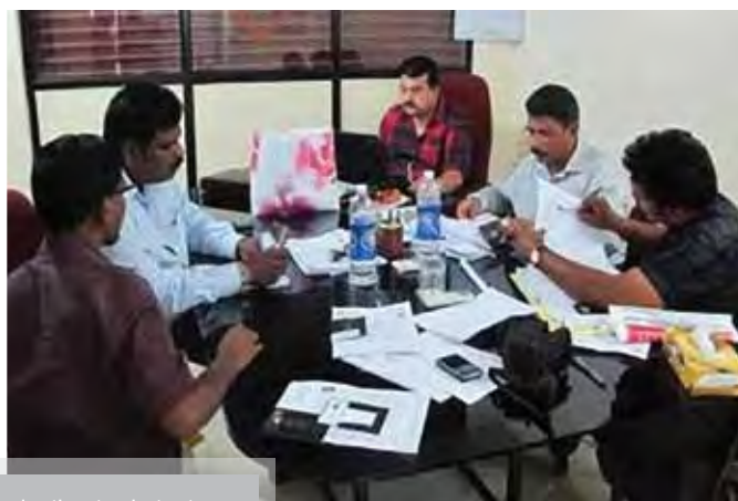
Lamprell delegates conducting trade tests and interviews in India and Bangladesh