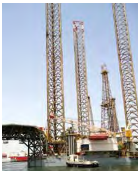
Rig Refurbishment | p.9