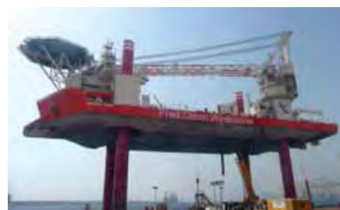
Wind Farm Installation Vessels | p.15

MIS Arabia | p.18 Lamprell Arabia | p.19 Lamprell at ADIPEC | p.20 People News | p.21 Lamprell and the Community | p.22