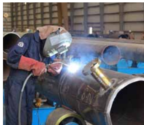
Jacketed pipe units for the Ma'aden Aluminium and Bauxite project for Hyundai / Fluor Worley Parsons