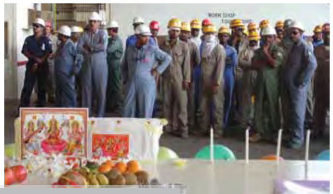
Lamprell employees celebrate Diwali, Indian festival of lights