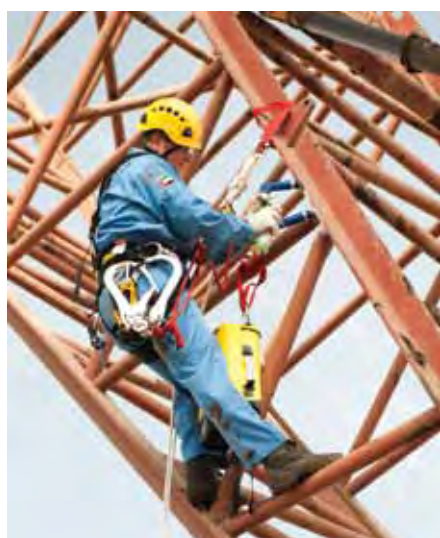
Service Businesses | p.16

MIS Arabia | p.18 Lamprell Arabia | p.19 Lamprell at ADIPEC | p.20 People News | p.21 Lamprell and the Community | p.22