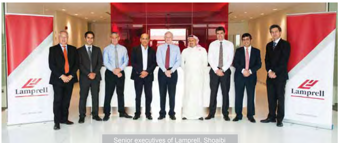
Senior executives of Lamprell, Shoaibi Group and AYTb after the signing ceremony