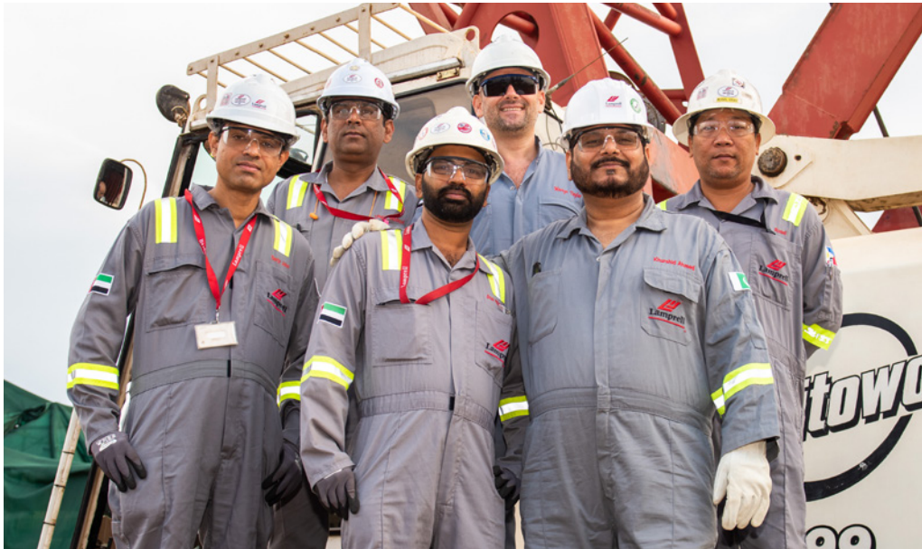
Asset Management and Maintenance teams