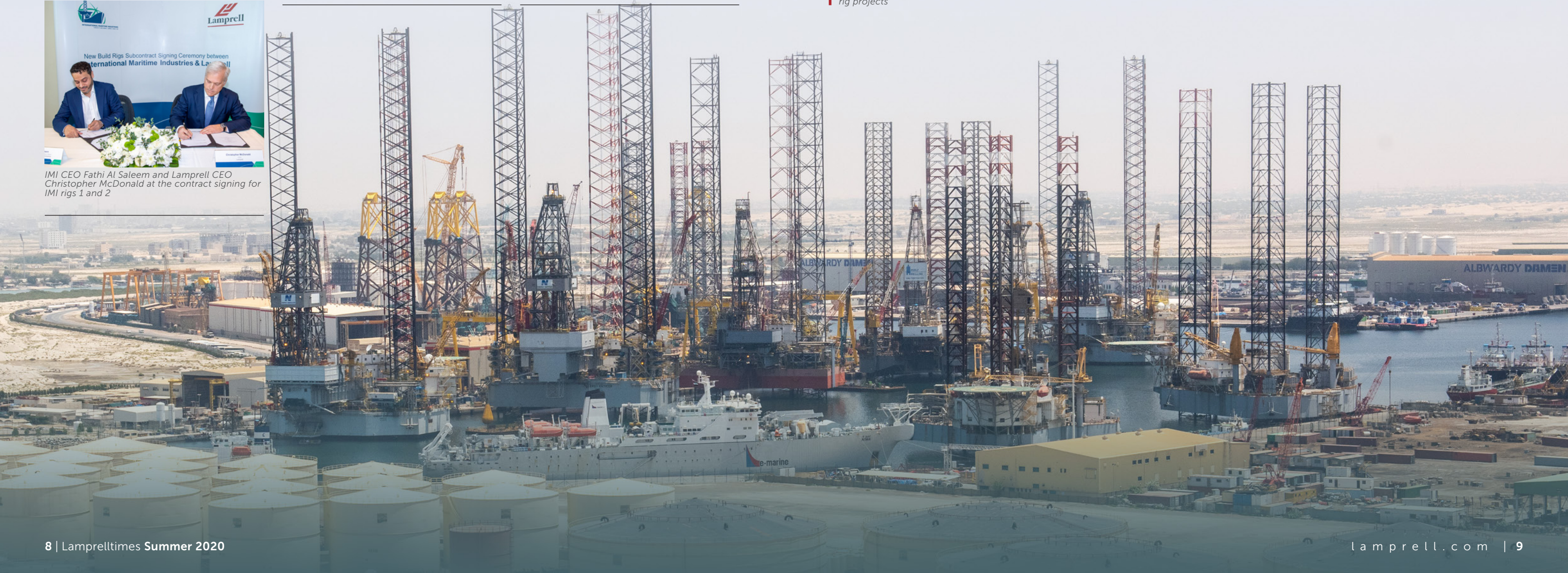
Lamprell's Hamriyah facility - rig projects

“Lamprell's rig refurbishment division remains active with a total of 15 jackup rigs spread across our yards at the time of writing.”