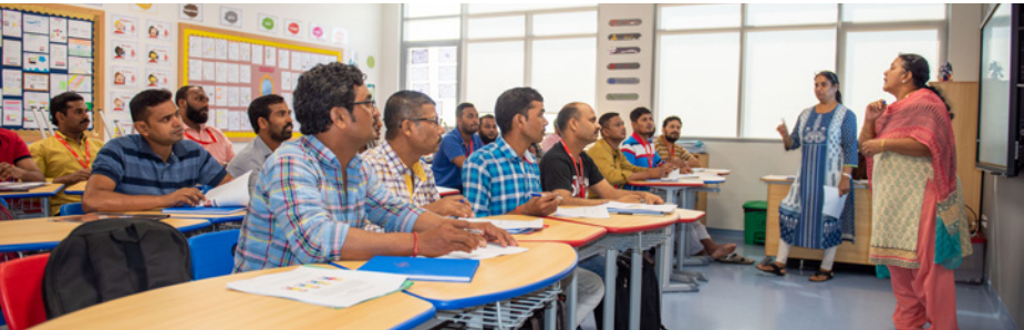
Free English classes initiated by Lamprell with local NGO, Smart Life Foundation at GEMS school Dubai.

Over 150 of Lamprell’s yard employees participated in a SmartReading English language programme which was rolled out in 2019 and completed earlier this year. SmartReading creates a space where employees can attend weekly classes and improve their reading and writing skills. Upon successful completion of the course, participants graduated and received various prizes for their participation and achievements. A huge thank you go out to Smart Life Foundation and GEMS Education who provided their classrooms for this initiative.