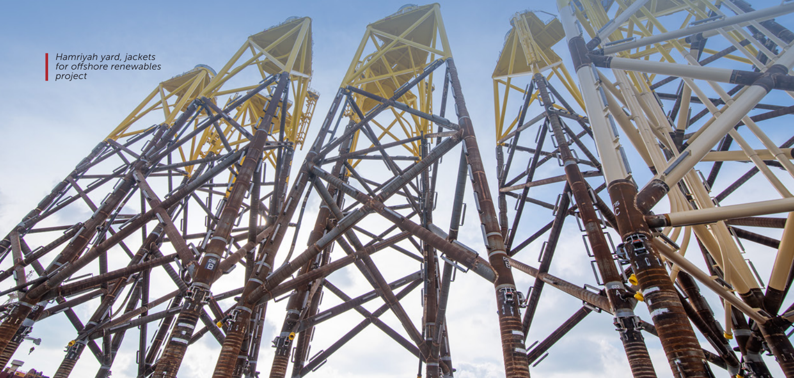
Hamriyah yard, jackets for offshore renewables project

“ ...our workforce is skilled and experienced to execute the project with a focus on the key drivers of safety, high quality and profitability. ”