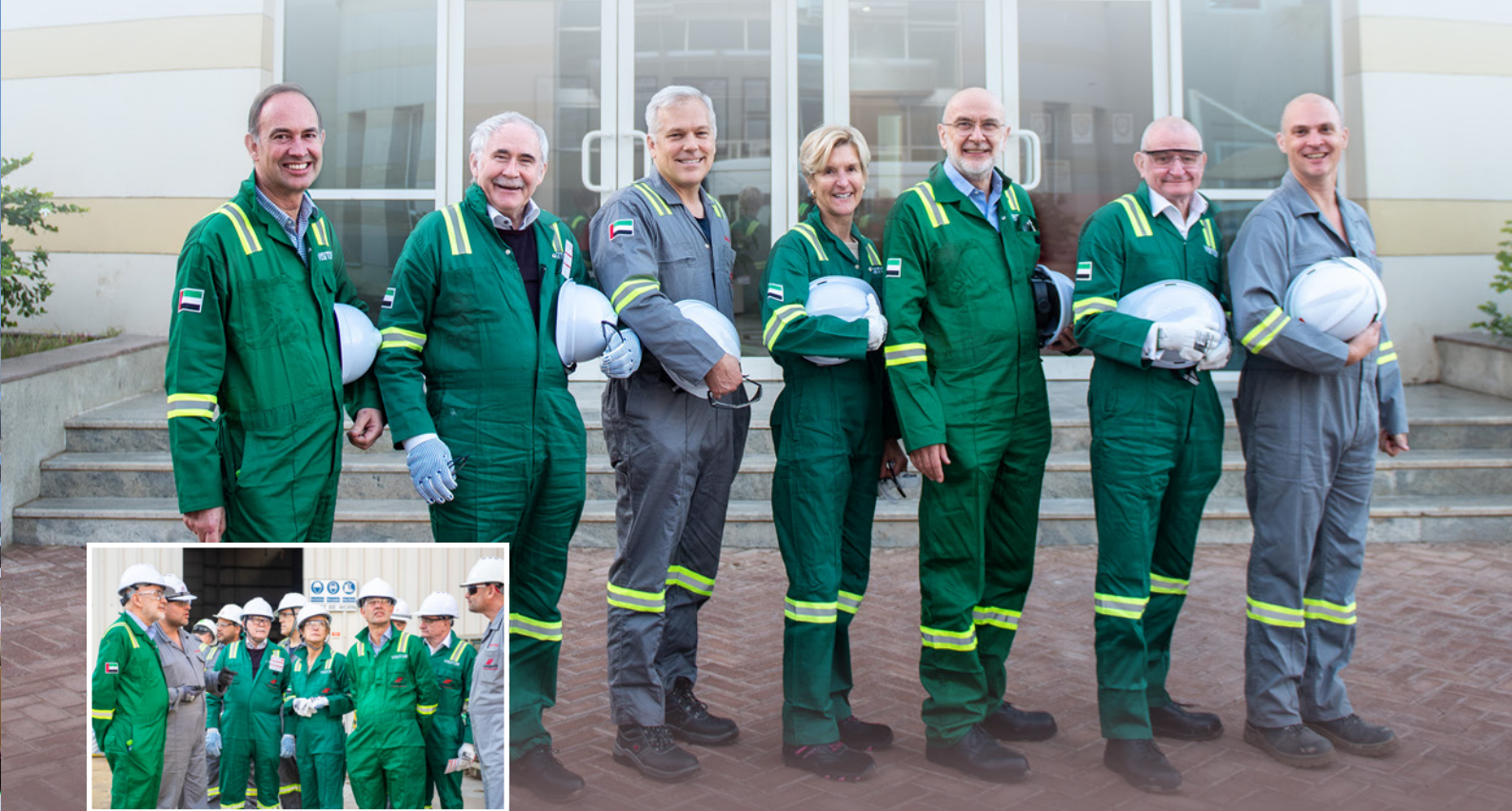
Members from Lamprell's Board of Directors visit the Hamriyah facility.

our yards is improving the way we manage our business including our people, processes, materials and more importantly, safety and security. A walk through the Moray East project site and a visit to the warehouse where the welding robots were in action allowed the Board to personally witness the yard optimisation efforts that will drive significant efficiencies within Lamprell's production.