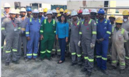
Lamprell's land rig team successfully delivered a project to client Halliburton

Lamprell won a contract to build a coiled tubing drilling (CTD) tower for client Halliburton, which was successfully delivered in H1 and is being used for coiled tubing drilling as well as traditional well-servicing purposes.