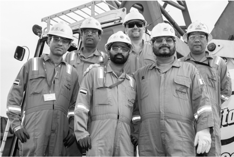
Feature article: Living our values Our Asset Management and Maintenance teams talk to us about what safety means to them.