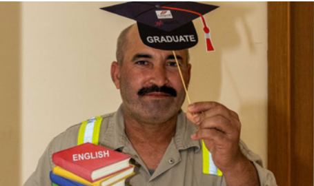
SmartLife graduation ceremonies held at Lamprell facilities in Hamriyah and Sharjah, in cooperation with Smart Life Foundation