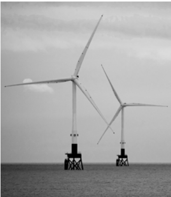
Feature article: The winds of change Learn more about the changing energy landscape and Lamprell's experience in renewables.