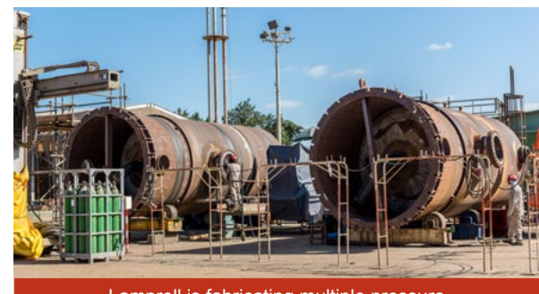
Lamprell is fabricating multiple pressure vessels in its Sharjah facility

de-aerator package for the Yibal Khuff project in Oman has been completed and fabrication has commenced. The scope of carbon and stainless steel vessels and the supply of process internals are on track for delivery in Q2 2017.